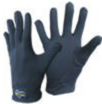
Full Finger FIR Gloves