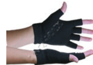
Open Finger FIR Gloves